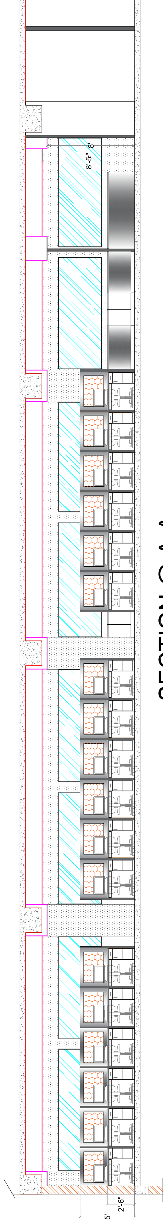
SECTION @ A-A