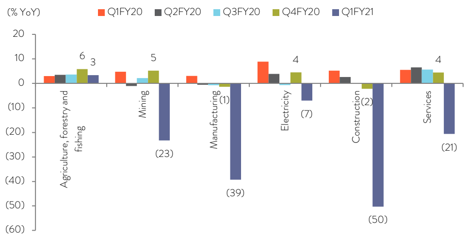
FIG 3 – EXCEPT AGRI, ALL SECTORS IN GVA FELL SHARPLY