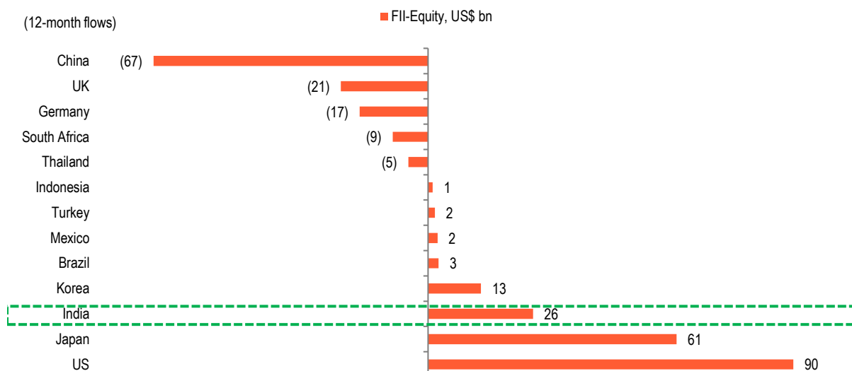
Fig 2: Country-wise data of FII-equity flows

Note: for 12 month flows the terminal data is the latest available data as of Mar'24, For Germany it is as of Jan'24, For US and China it is as of Dec'23 and for UK it is as of Sep'23.