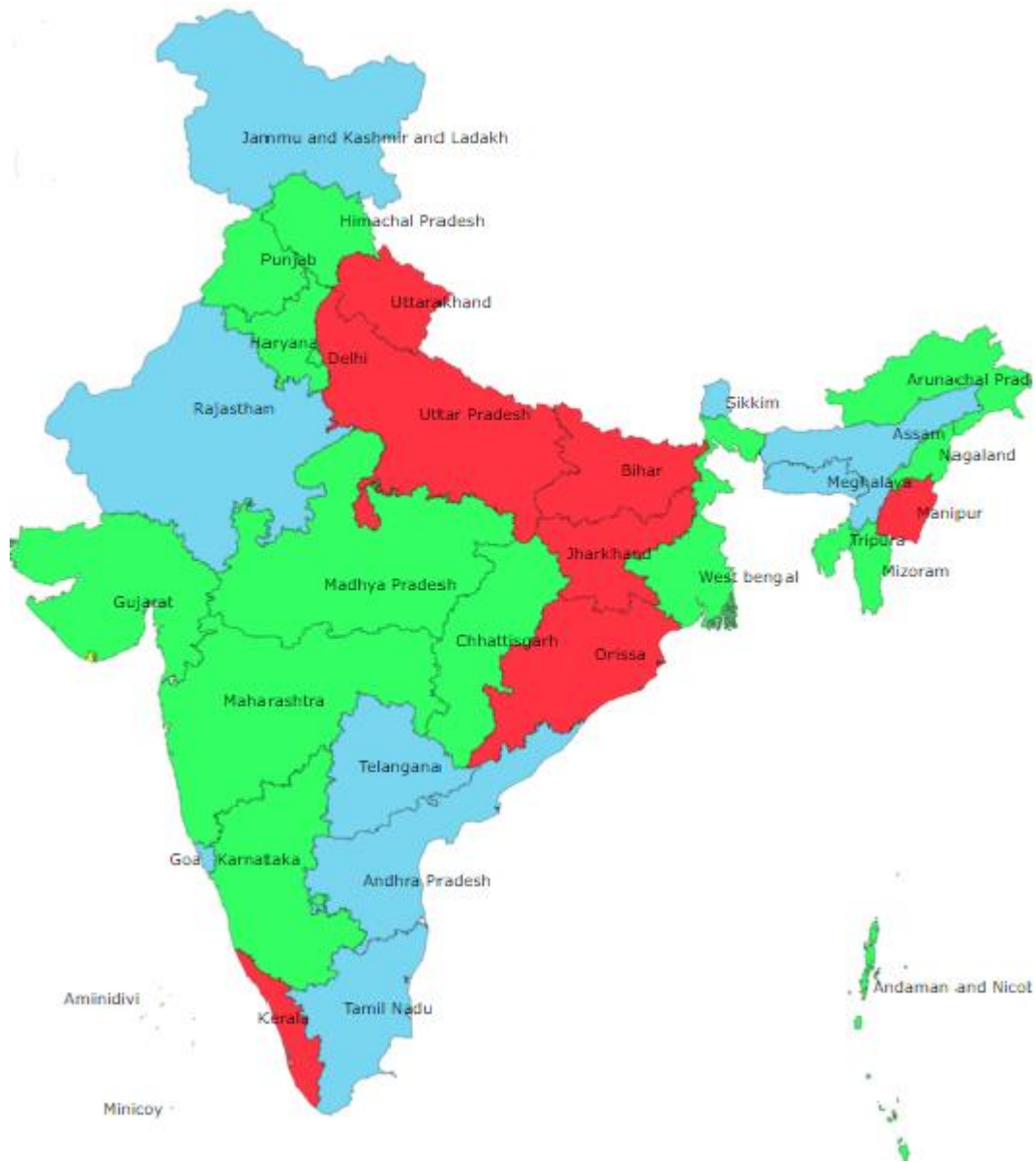
Fig 1: Distribution pattern of South-West Monsoon

Source: IMD, Bank of Baroda Research | Period from 1 Jun-8 Jul 2022.